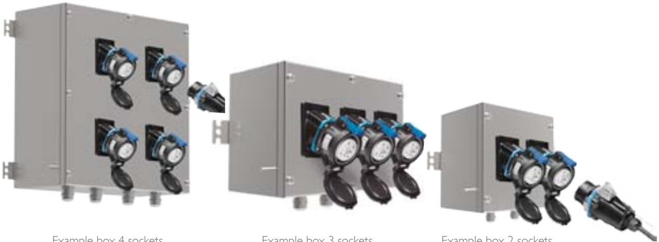
Example box 4 sockets